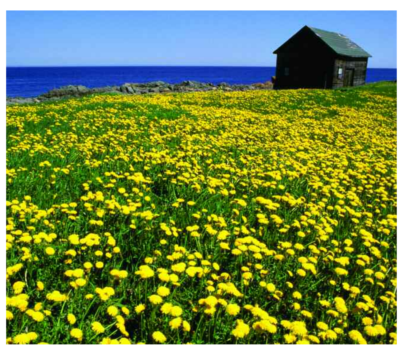
This cheerful field of dandelions is near Métis on the lower estuary.