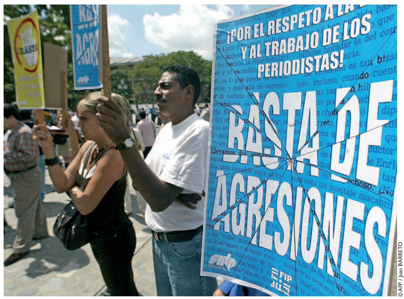
Demonstration by Venezuelan journalists against attacks on the press.