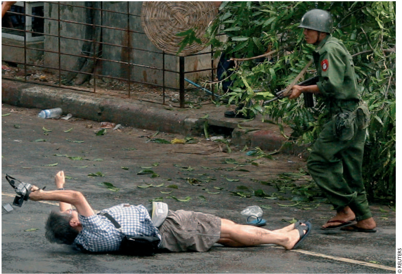
A Burmese soldier shoots Japanese reporter Kenji Nagai at close range in Rangoon on 27 September 2007.