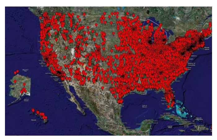
Map of nanoHUB.org user locations.

Nano-transistor simulated on nanoHUB.org using High Performance Computing.