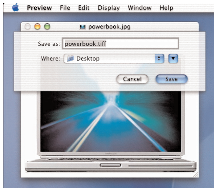
A non-modal save dialog in Mac OS X remains linked to its parent window.

A prime example of this user-focused design is the use of "sheets." These non-modal dialog boxes attach directly to the title bar of the relevant document, intuitively linking document and action. The non-modal nature of sheets prevents applications from hijacking the system and interrupting user workflow.