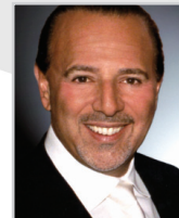
TOMMY MOTTOLA President/CEO Casablanca Records