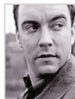
DAVE MATTHEWS Bama Rags/RCA