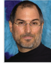
STEVE JOBS CEO Apple