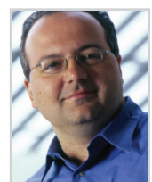
ROB GLASER Founder & CEO RealNetworks, Inc