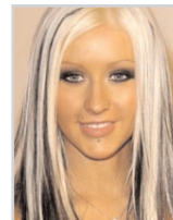
CHRISTINA AGUILERA RCA Records