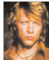
JON BON JOVI Island Records