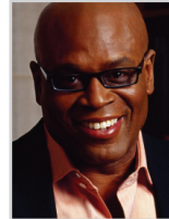
ANTONIO "L.A." REID Chairman Island Def Jam Music Group