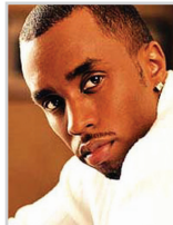
DIDDY CEO Bad Boy Ent.