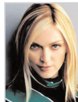
MADONNA Warner Bros.