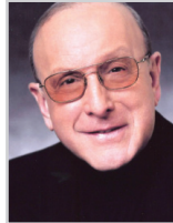
CLIVE DAVIS Chairman/CEO BMG North America