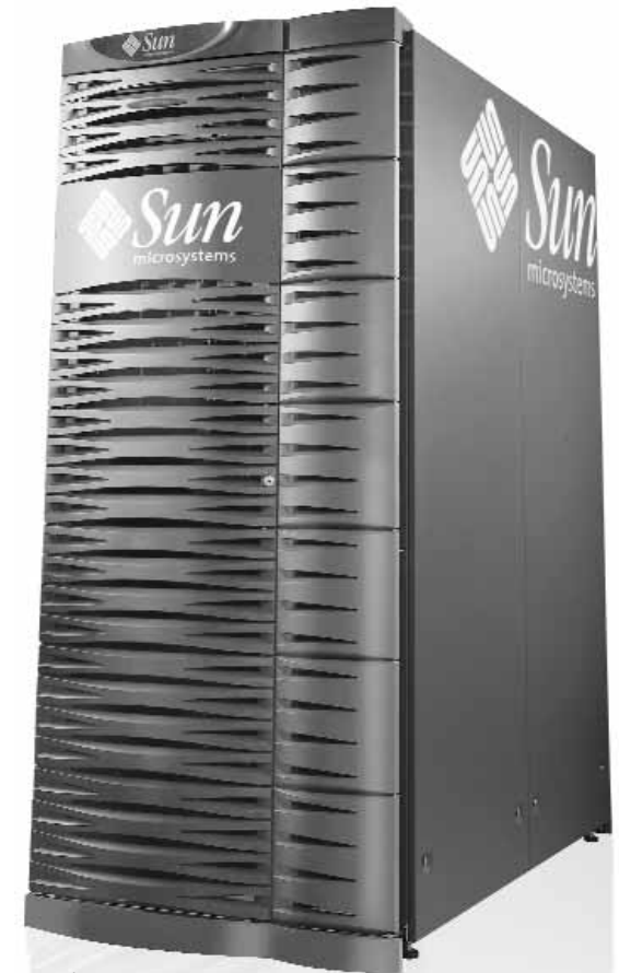
Sun Fire Server