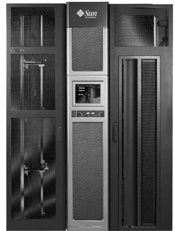
Sun StorageTek Tape Library