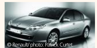
Renault's new Laguna

French automobile manufacturer Renault unveiled its latest Laguna series, the Laguna 3. Renault's cross-shareholding alliance with Japanese automaker Nissan has brought growth and improved quality to both companies since reaching the agreement in 2000; this latest model seeks to merge Japanese reliability with a distinctly modern French automobile. Renault is offering a three-year, 100,000-mile warranty on the car, as opposed to its standard 60,000 mile warranty as a commitment to the quality of the vehicle's build. Though the design has been refreshed, it retains the contemporary and unique themes of the previous model.