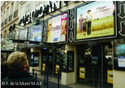
Moviegoers in 2006 make their selection, taking advantage of discounts during La Rentrée du Cinéma

La rentrée also applies to politicians. Traditionally, a "kick-off" event launches the political year, signaling an