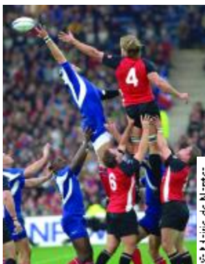
As the 2007 RWC kicks off, the event is gaining both sports fans and environmentalists' attention

Rugby fans across the world are focusing on France this fall as the country hosts the 2007 Rugby World Cup (RWC), the first Francophone country to ever do so. The event, which runs from September 7 to October 20, is drawing attention not only as a major international sporting event, but also as a landmark in environmental protection. Event planners and the French gov-