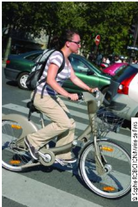
Vélib' allows for economical and environmentally-friendly means of transportation

Above all, the program offers convenient access: the service is available twenty-four hours a day, seven days a week, and the stations will be just 1,000 feet (300