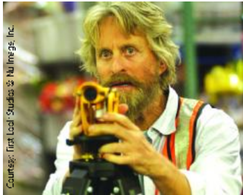
Michael Douglas in "King of California." This year's festival paid special tribute to Douglas's career

Actresses Sigourney Weaver, Ida Lupino and award-winning director Sidney Lumet also received special tributes during the festival.