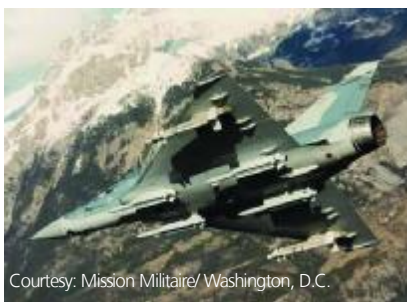
France will soon deploy 6 additional aircraft to support operations in Afghanistan

In all, more than 250 French soldiers (out of the 1,200