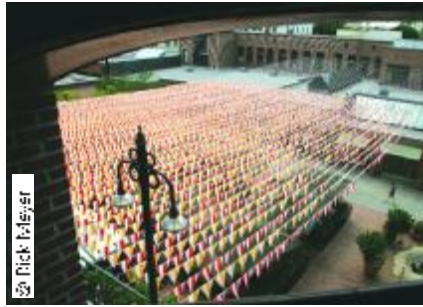
Daniel Buren's "A Colored Square in the Sky"

Internationally renowned and honored French artist Daniel Buren has done it again. After gaining recognition for monumental pieces including exhibitions at the Palais Royal in Paris, Beijing's Forbidden City, and the Guggenheim in New York City, he has now moved on to the heart of Old Pasadena, California. His latest piece, titled "A Colored Square in the Sky," is made up of his signature striped flags—8,722 of them to be exact—aligned in 98 rows of flags, each 17 feet above the courtyard of