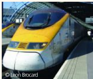
The new Eurostar service is approximately 20 minutes faster

Beginning November 14, Paris and London will become closer than ever before. Eurostar commuters and leisure travelers will be able to make the trip from London's newly refurbished St. Pancras International Station to Paris's Gare du Nord in less than two hours and fifteen minutes—about 20 minutes faster than before. The completion of High Speed 1, Britain's newest stretch of high velocity rail networks running from the English Coast to London, has made the faster trip possible. The French SNCF debuted the train service on September 4, leaving the Gare du Nord and arriving in London just two hours, three minutes and 39 seconds later, a new record. Previously, trains running through the Channel Tunnel had to slow down upon exiting rails into England, where conventional lines.