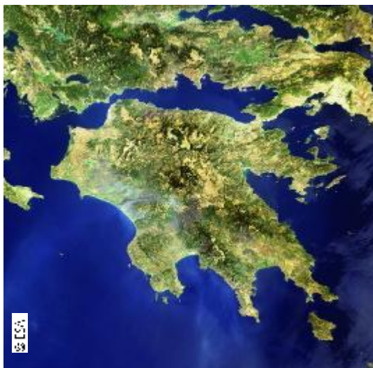
This satellite image reveals a haze of smoke over the Peloponnese region in Greece

The European Space Agency recently put to use some of its advanced satellite imaging technology to help fight the fires that have been plaguing parts of Greece and