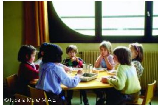
Schools in France welcomed students back September 4