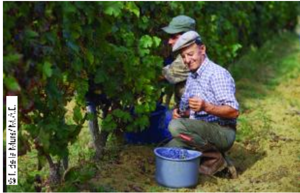
French and Italian researchers have decoded the complete genome sequence of grapes, which could provide new insight into boosting wine's flavor and resistance to disease

the industry go toward combating mildews and other diseases which afflict grapes, collectively causing tens of millions of dollars in damage each year. Families of genes responsible for the aromatic components of wine were discovered, particularly those relating to Tannins, elements of grape skin and seeds, which contribute to body