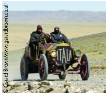
The Itala chugging up and over a mountain range in Mongolia

For more information regarding the Peking to Paris motor rally, please visit: www.pekingparis.com .