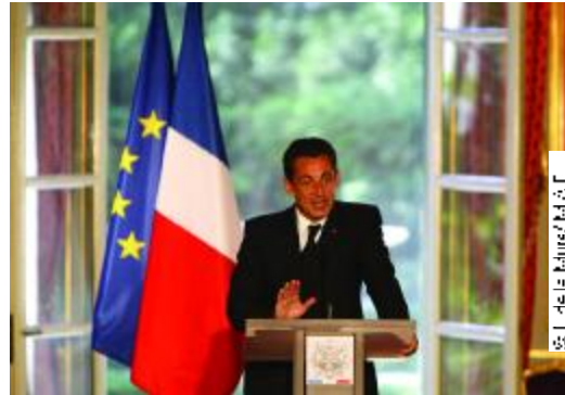
French President Nicolas Sarkozy lays out the roadmap of France's new foreign policy at the 15th Annual Ambassador's Conference

Finally, President Sarkozy, in words similar to those that epitomized his approach since coming into office, stressed that "the government will show the same kind of determination in the international arena that it is demonstrating domestically."