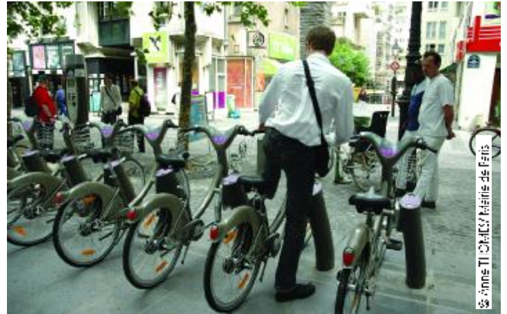
The Vélib' averages between 50,000-70,000 rentals a day

Cyclist behavior has led to concerns about safely sharing the road. Although Vélib' does not loan helmets, every Vélib' subscriber receives a pamphlet encouraging bike safety. To decrease the likelihood of accidents, the city has been advocating safe practices for sharing the road between cyclists and drivers. Fortunately, road safety studies reveal that bicycling in a city becomes less dangerous as the number of cyclists increases because drivers become accustomed to sharing the road. Indeed, the number of bicycle accidents has only risen by six percent in Lyon since Vélo'V