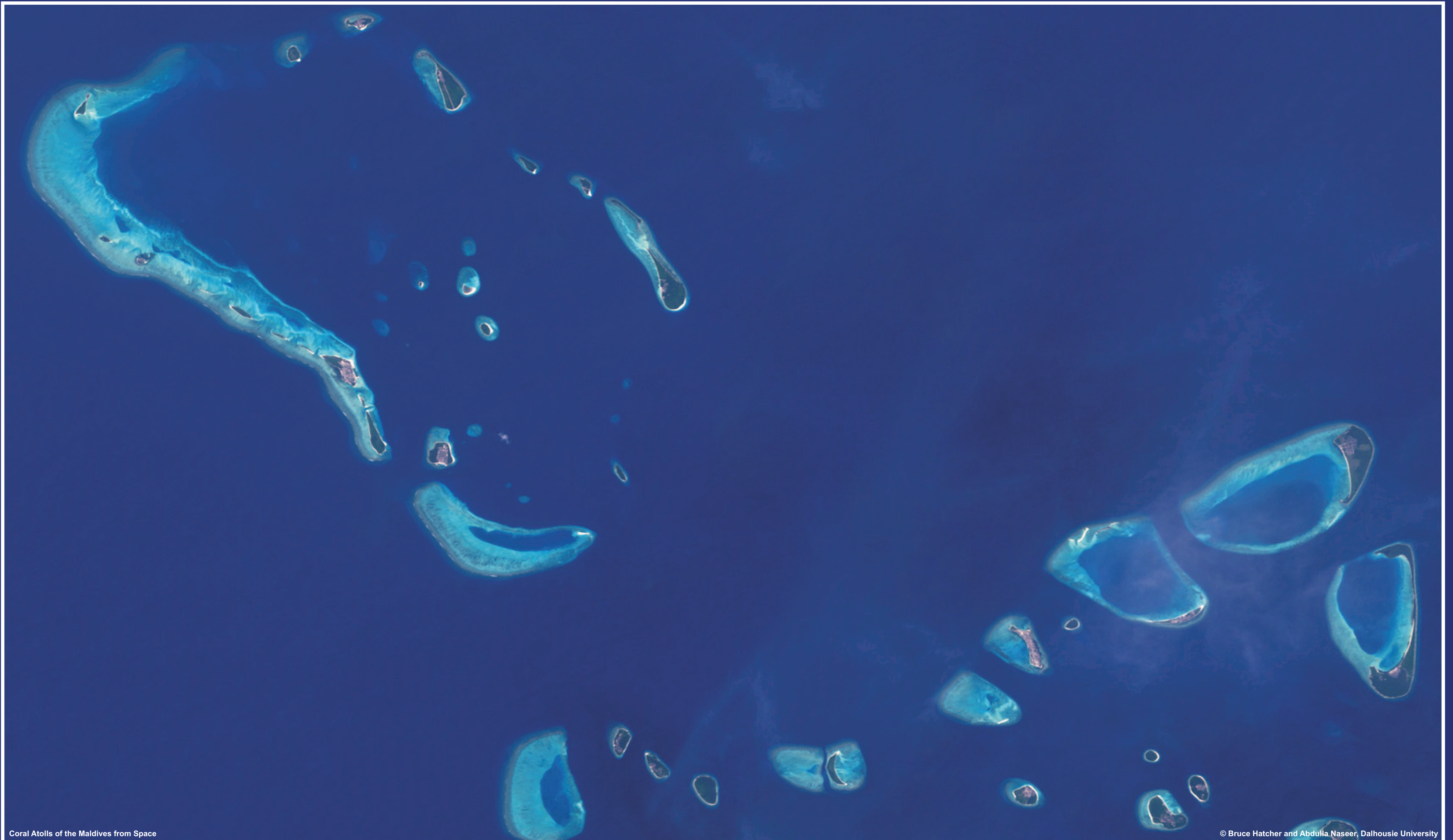
Coral Atolls of the Maldives from Space