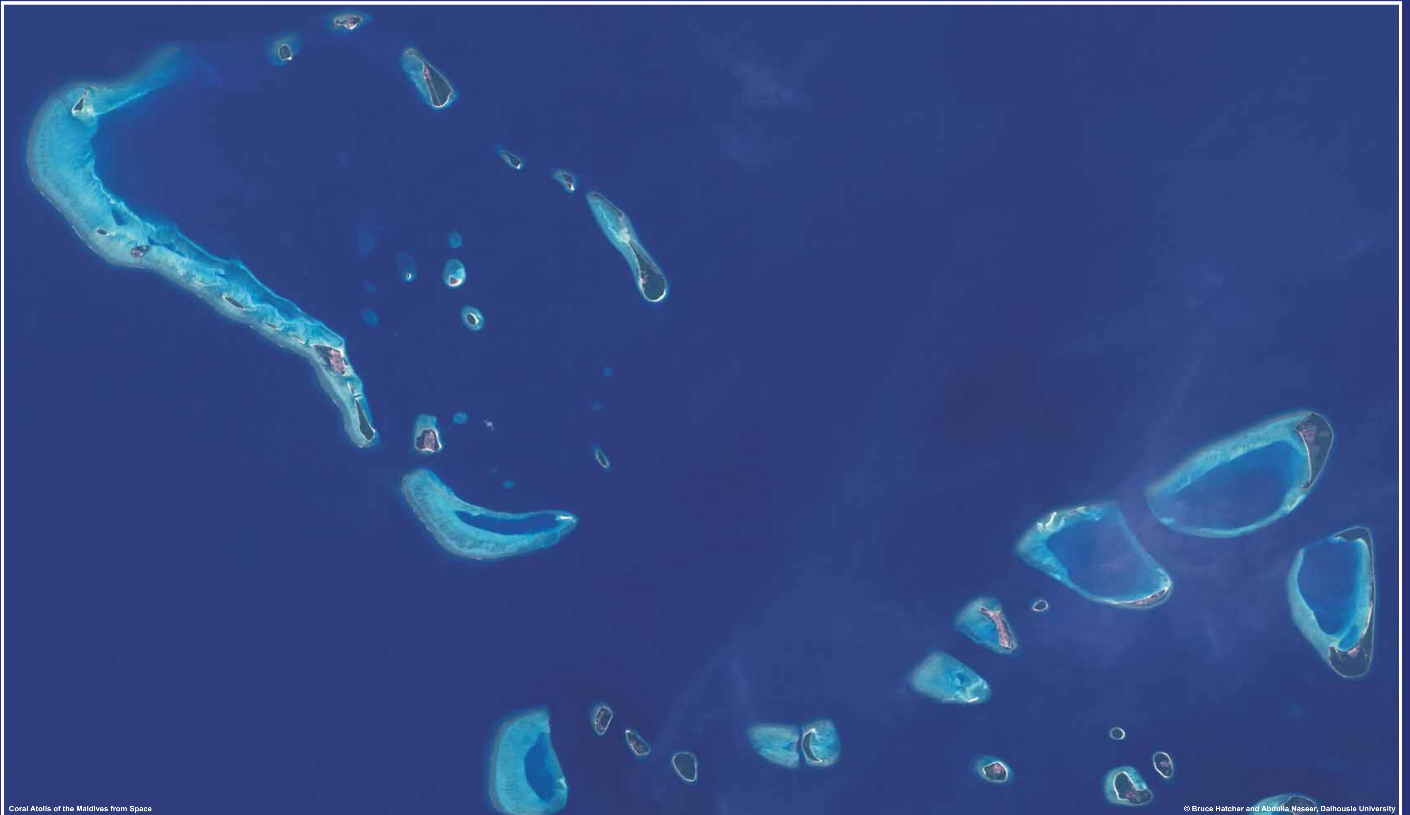
Coral Atolls of the Maldives from Space