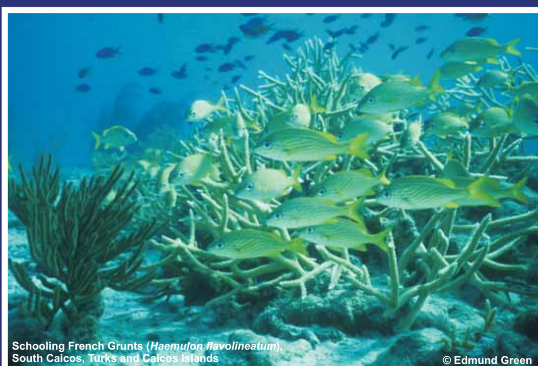
Schooling French Grunts ( Haemulon flavolineatum ) South Caicos, Turks and Caicos Islands

In parallel with other tropical ecosystems such as mangroves and seagrasses, coral reefs protect our beaches and shorelines and coastal property.