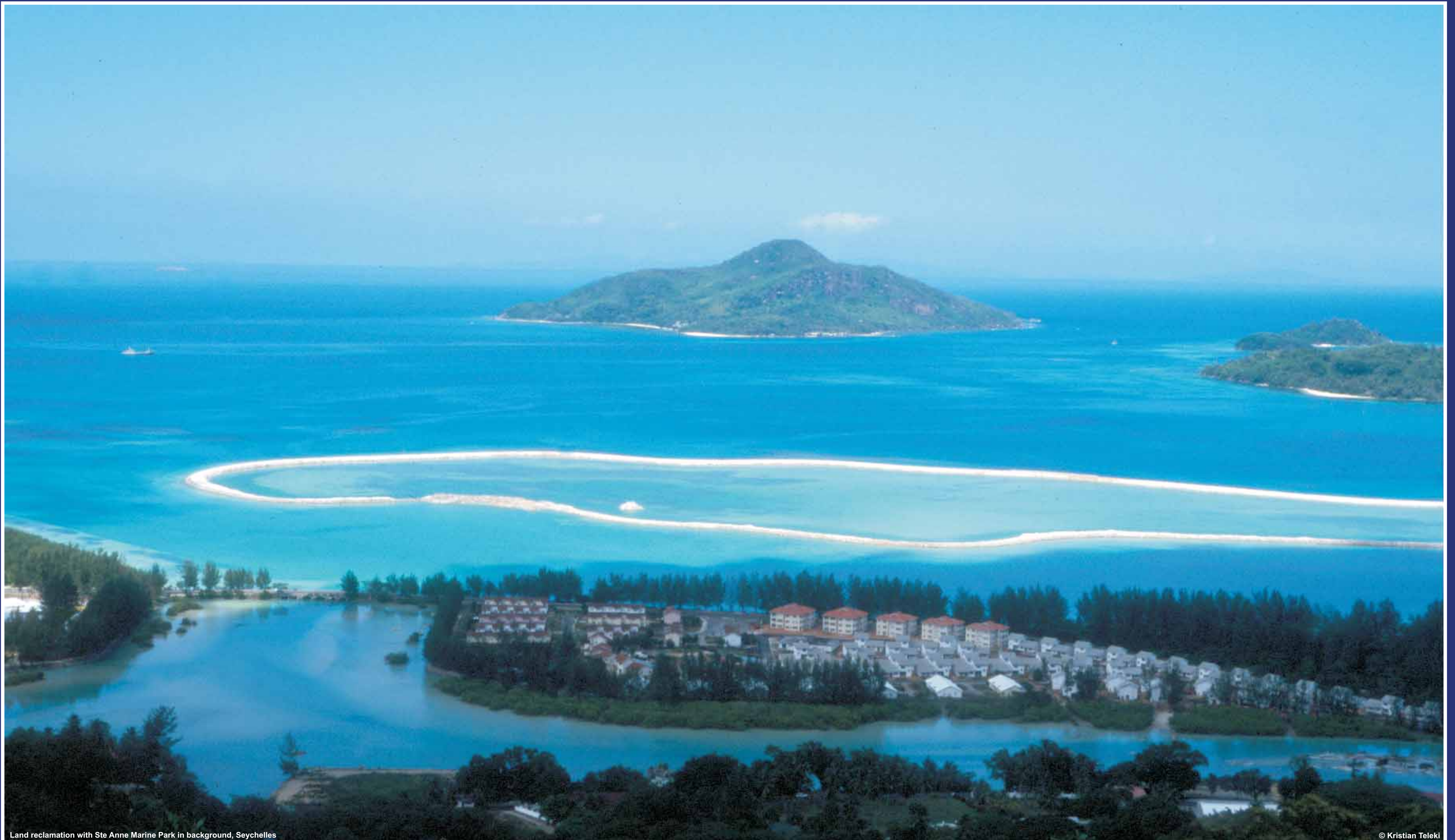
Land reclamation with Ste Anne Marine Park in background, Seychelles