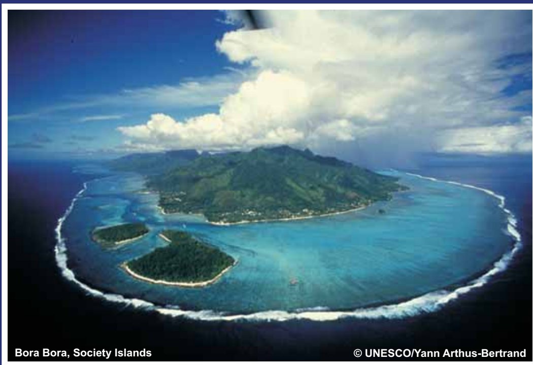
Bora Bora, Society Islands

ICRAN's strategic approach to reef management, assessment and education has been developed to secure the future of these valuable ecosystems, as well as the future of the communities they sustain.