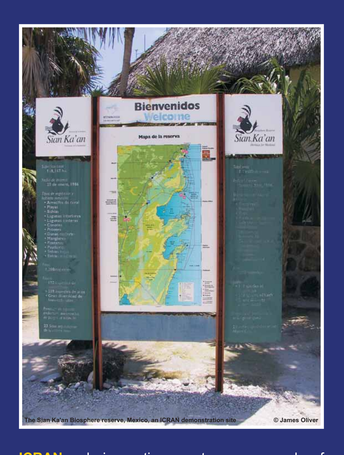
ICRAN seeks innovative ways to manage coral reef ecosystems to meet the needs of the people depending on them. It assists local communities to continue building on successful management techniques though sharing experiences and lessons learned with other communities.

A number of operational networks are recognised by ICRI to assist in achieving the Framework for Action. Two examples are The Global Coral Reef Monitoring Network (GCRMN) and the International Coral Reef Action Network (ICRAN).