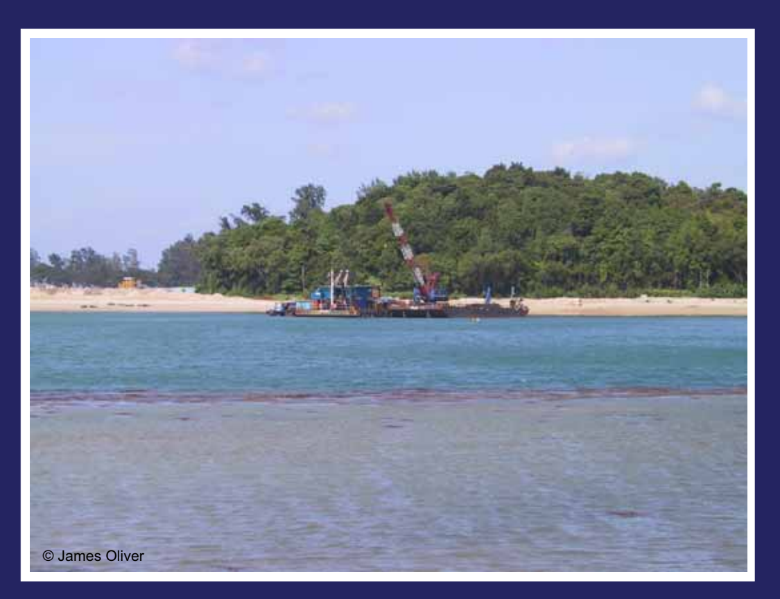
The impact of dredging on coral reefs varies depending on the dredging technique, timing, types of reef organisms in the area, local conditions and influence of any other sources of stress.