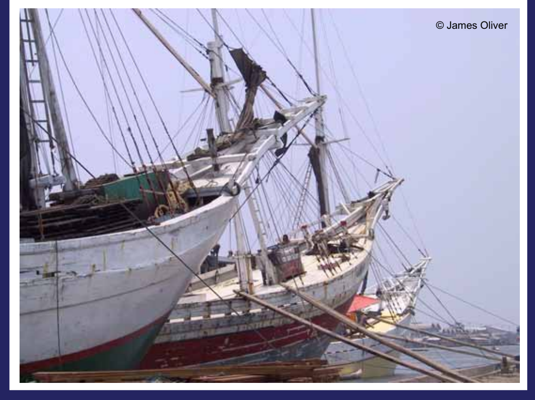
Port and harbour construction is essential for domestic and international economic development for many coral reef countries and territories.