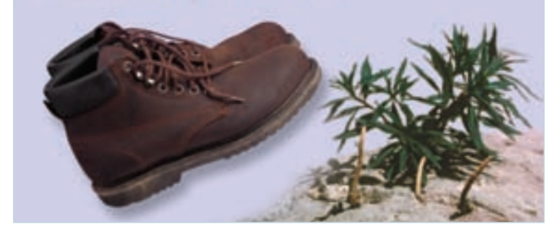
Plants grow by the inch, and die by the foot ... Please stay on the trail.