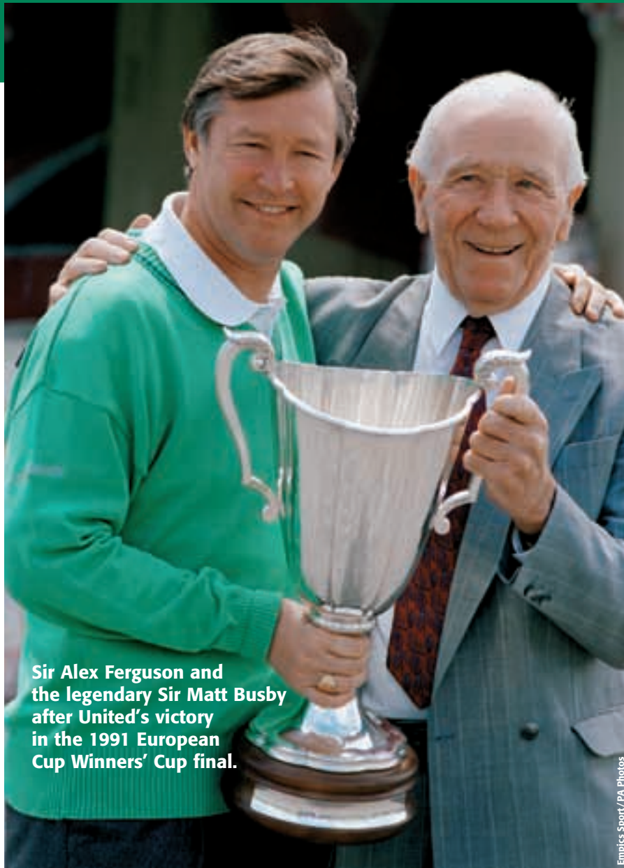
Sir Alex Ferguson and the legendary Sir Matt Busby after United's victory in the 1991 European Cup Winners' Cup final.