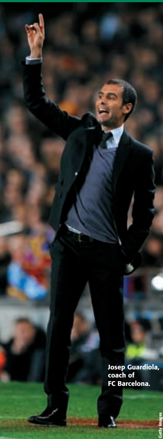
Josep Guardiola, coach of FC Barcelona.