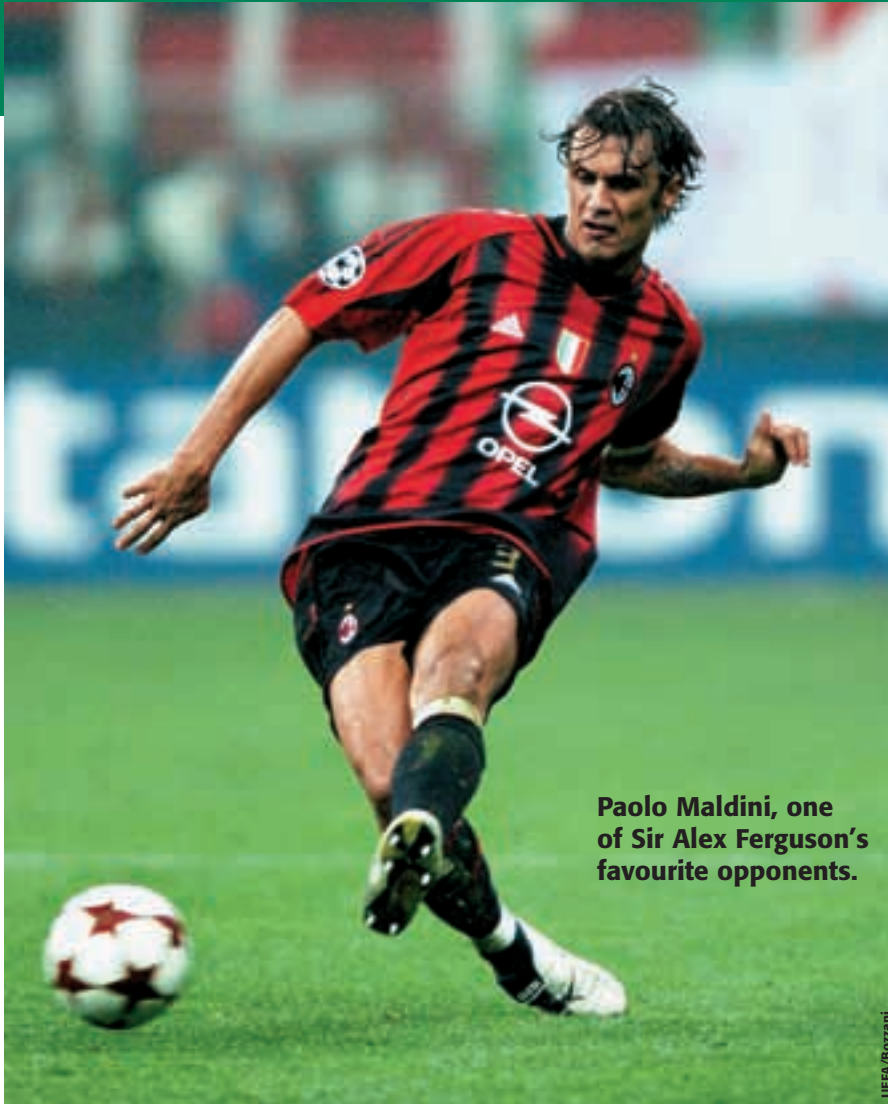
Paolo Maldini, one of Sir Alex Ferguson's favourite opponents.