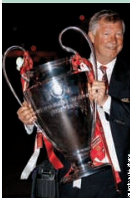
Sir Alex Ferguson with the UEFA Champions League trophy won by Manchester United in 2008.

Well, they have certainly changed in terms of the back-up required, particularly in the area of sports science. Medical information, nutrition and preparation of players for top-level games have reached another level. What has not altered, in our case, is the insistence that players train to a high standard – we have always aimed for 100% quality. I have never changed that approach because, in my opinion, what we do on the training pitch transfers to the matchday. We never allow lazy training sessions. For me, the training is an opportunity for players to express themselves as professionals. Players who don't commit themselves at training can have a negative impact on the others and things then deteriorate into a shambles – then you are not a real