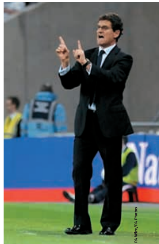
Fabio Capello in expressive mode in the technical zone.

By altering the text relating to the technical area, the IFAB has taken a common sense approach and shown respect for technicians and the role that they play in today's football. It has been a lengthy, sometimes painful, process for the coach's job and working conditions on the touchline to be acknowledged and recognised in a tangible way. The technical area, when used properly, adds an important, positive dimension to the game. We have come a long way since the introduction of the trainers' bench at Aberdeen FC – let's hope that the coach's new-found freedom will reduce conflict and increase professional composure on the touchline. Fundamentally, football is a game for players. But coaches can make a significant contribution to individual and team success – at the training ground, in the dressing room, and from the technical area.