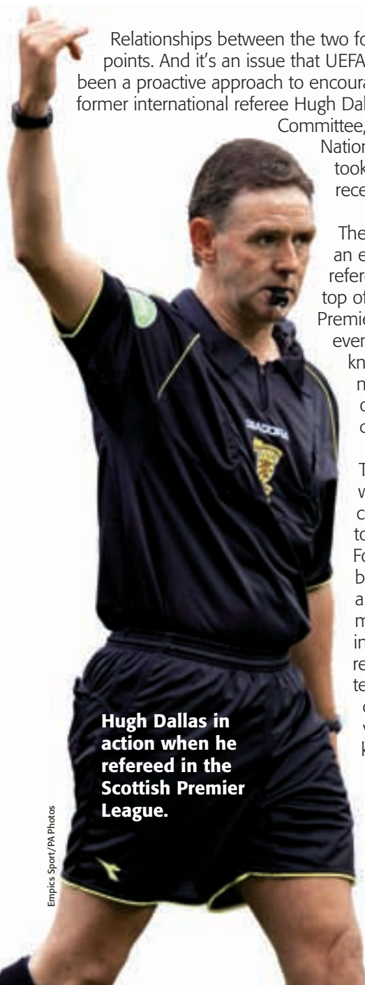
Hugh Dallas in action when he refereed in the Scottish Premier League.

Coaches and referees play roles in an intensely competitive sport which is subject to exhaustive public scrutiny. They have to be equipped to deal with crises, stress and big egos. They have