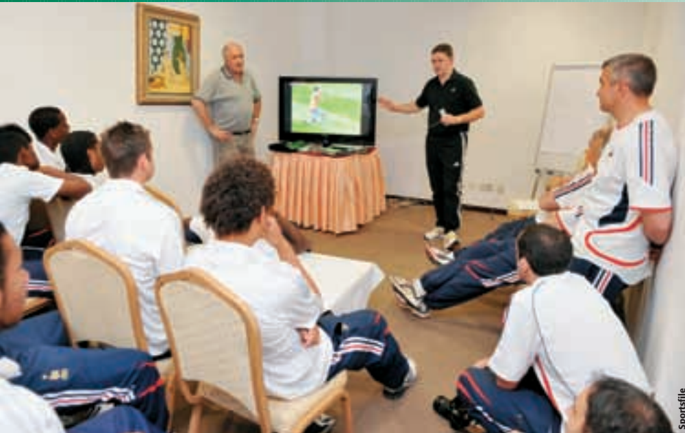
Giving explanations to the French Under-17s at the final round of their 2007/08 European championship.

to be prepared to take risks and big decisions. In other words, knowledge and talent may be important, but they are not necessarily enough. Personality counts – especially in an era where the leader's position and decisions are readily challenged.