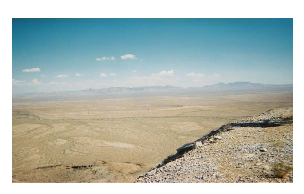
Moapa Band of Paiute Reservation