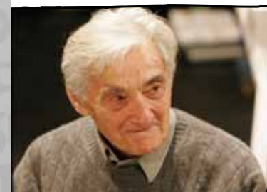
Author, Howard Zinn

points in American history, and the ways average citizens have agitated for transformation. These gripping, shocking, and triumphant stories can inspire students to learn more about the past and to remind them that participation in civic culture is as American as apple pie.