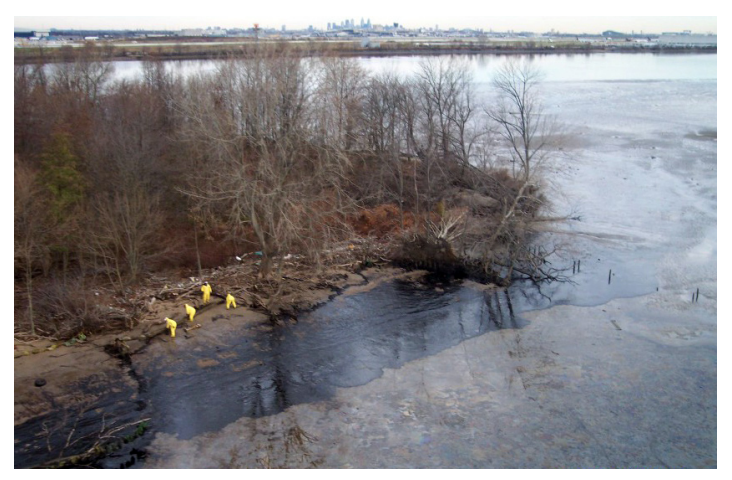
Oiled shoreline and cleanup of Tinicum Island 11/29/2004.