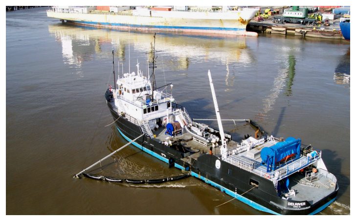
Athos I oil spill clean up, 2004. NOAA overflight 12/2/2004.

NOAA has scientists based in each U.S. Coast Guard district to provide scientific support for spills. At the Athos I , NOAA provided hazard and shoreline assessments, information on oil behavior and movement, cleanup recommendations, risk communication, and public outreach. NOAA's data input and expert advice was used to help prioritize response efforts, to maximize recovery efforts, and minimize environmental damage. Submerged oil caused the closure of the Salem Nuclear Power Plant, the second largest in the U.S. NOAA conducted field surveys and provided modeling tools for reopening the facility.