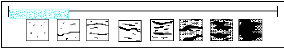
this scale bar shows the meaning of the distribution terms at the current time