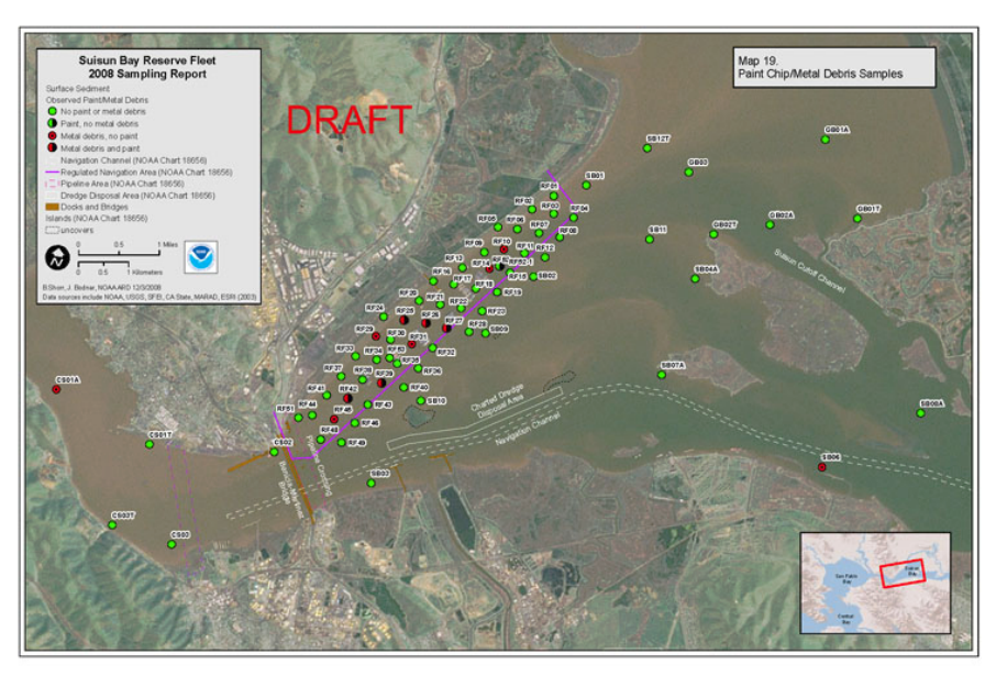
This map show results of NOAA's surface sediment grab sampling for paint chips and metal debris.

NOAA will continue to revise the draft report and prepare for document release at the end of February.