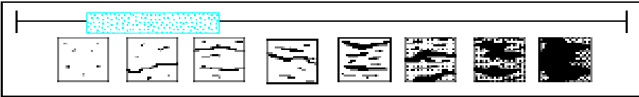
this scale bar shows the meaning of the distribution terms at the current time

A portion of the oil (numerous scattered light sheens with some emulsified patties and streamers) has been observed moving to the southeast over the last few days. Most of this oil appears to be being entrained into a large counterclockwise rotating eddy and moving back to the north or northwest. The northern boundary of the Loop Current (LC) is to the south of this eddy, and scattered sheens have been observed on the boundary between the eddy and the LC. In this region, surface currents bifurcate and models predict some of the oil in this region will continue to be entrained in the northern eddy, whereas some of this oil may also become entrained into the LC.